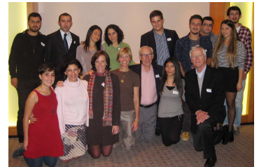
The Turkish Gallagher Scholars at the Scholar Dinner in October 2011