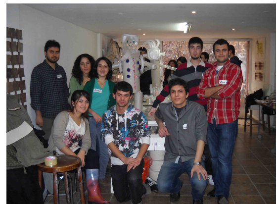
Turkish Gallagher Scholars during their most recent gathering