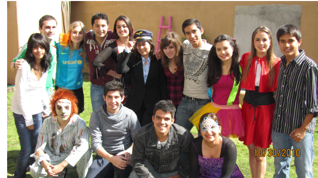
Mexican Gallagher Scholars at the Fall Halloween Party