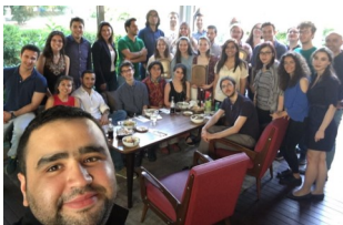
Turkish Scholars celebrate at the Turkish Graduation dinner