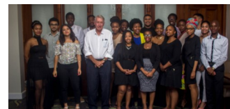
South African Scholars at the Graduate Dinner