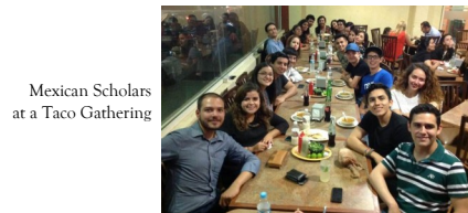
Mexican Scholars at a Taco Gathering