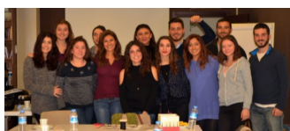
Turkish Scholars at a Jewelry Making Gathering