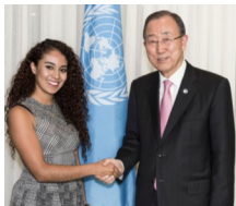
Nelly was Invited to Attend the ECOSOC Youth Forum 2017