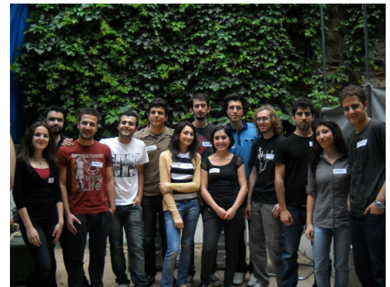
The Turkish Gallagher Scholars at a gathering in Spring 2012