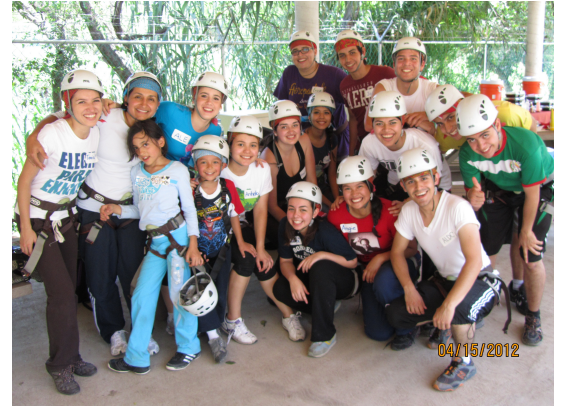
The Mexican Gallagher Scholars at Tec Challenge in Spring 2012.

The Mexican Scholars have a number of gatherings throughout the school year. The gatherings are lunch meetings, graduation dinners, and a team building event called Tec Challenge. Tec Challenge is an all day event where the Scholars do a series of different challenges where they need to work together to accomplish the goal.