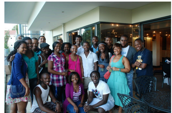
The South African Scholars at a gathering in Spring of 2012

The South African Scholar gatherings throughout the school year are: a tour of the Cape Town peninsula for the new Scholars, dinners and a team building event. This year for their team building event they participated in a service project with an organization called Stop Hunger where they packaged meals.