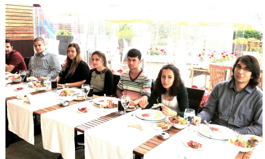
Some of the Turkish Gallagher Scholars at the May graduation dinner