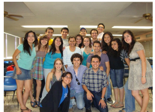
The Mexican Gallagher Scholars at a gathering last spring