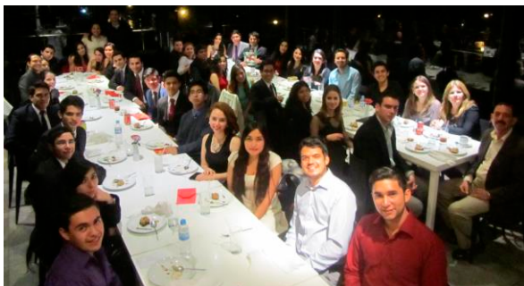
Mexican Scholars at Graduation Dinner