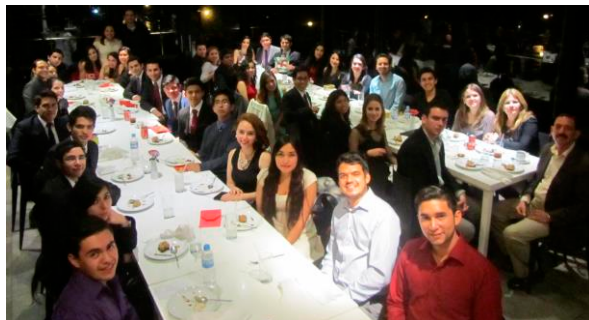
Mexican Scholars at Graduation Dinner