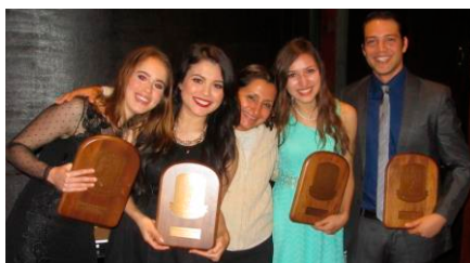
Recent Mexican Scholar Graduates at their Graduation Dinner