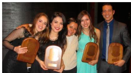
Recent Mexican Scholar Graduates at their Graduation Dinner